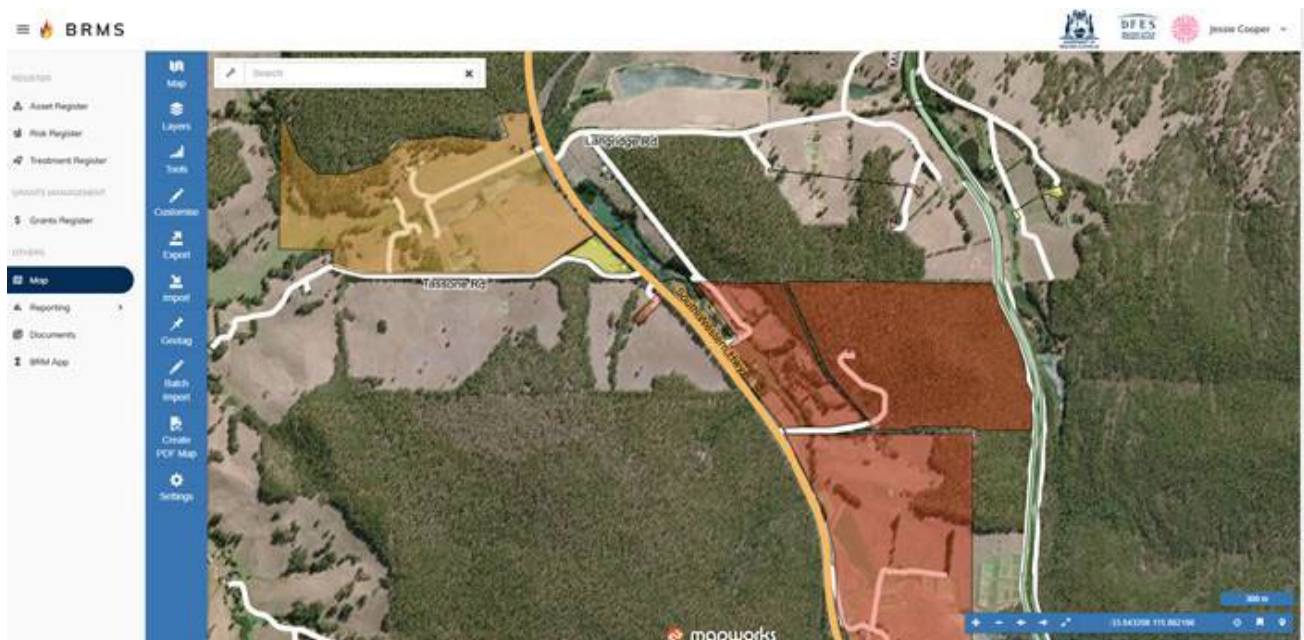
Figure 1 – Bushfire Risk (Plan generated 8/11/2024)

As outlined in the November report, the Department of Fire and Emergency Services Bushfire Risk Management System (BRMS) identifies the immediate area of the event location as an extreme bushfire risk.