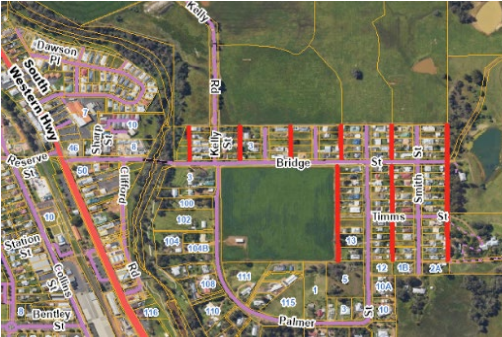
Figure 3: Right of Ways – Lot 123, Plan 2170