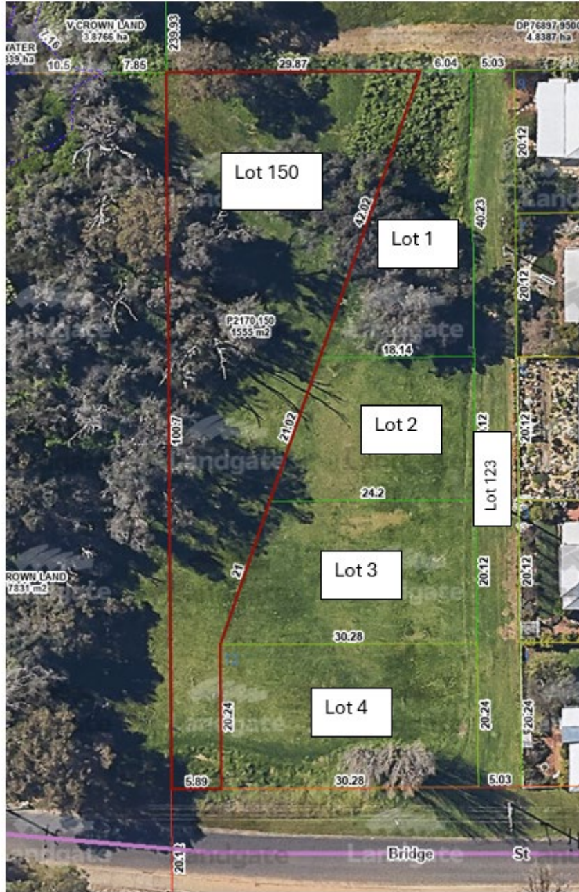
Figure 2 – Aerial of Immediate Locality

Lots 3 and 4 are owned by the Water Corporation for the purposes of a future sewerage pump station. Lots 1 and 2 are owned by the Shire as freehold land. The right of way located immediately adjacent forms part of Lot 123, encompassing all the right of ways on Plan 2170, which are also owned in freehold by the Shire. These right of ways are highlighted in Figure 3 below: