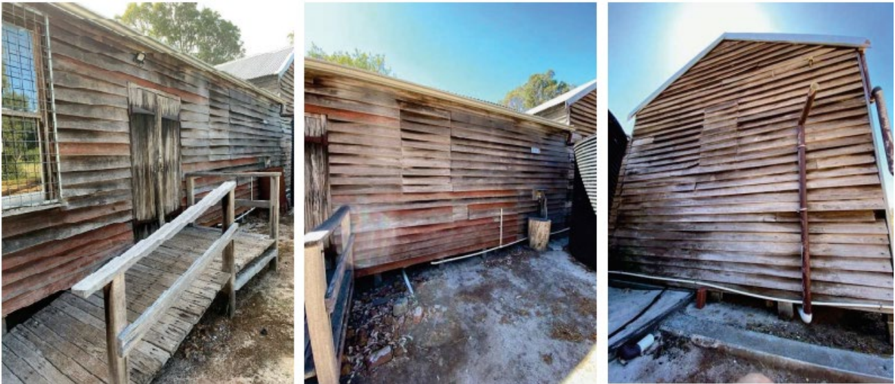
Figure 4 – Rear elevation of Brookhampton Hall