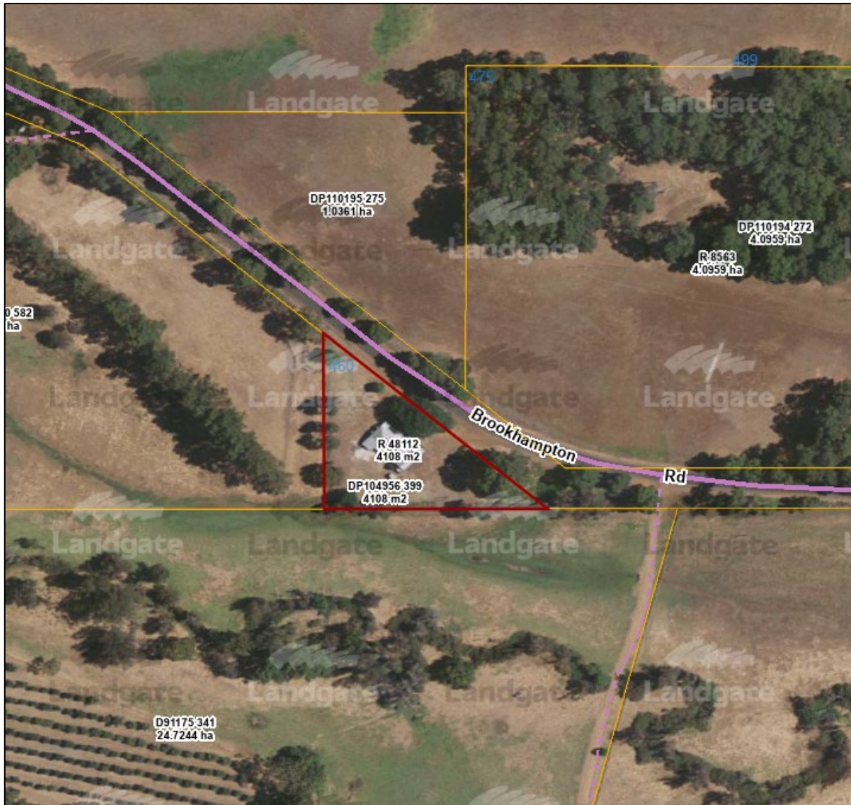
Figure 1 – Brookhampton Hall Reserve 48112 bordered in red.