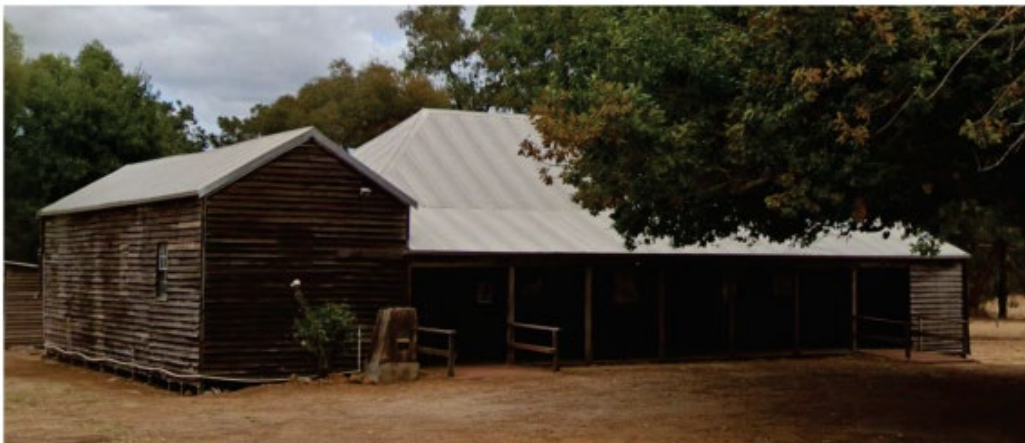
Figure 3 – Street view of Brookhampton Hall

Note: The recommended approval conditions require the handrails and ramp to be timber.