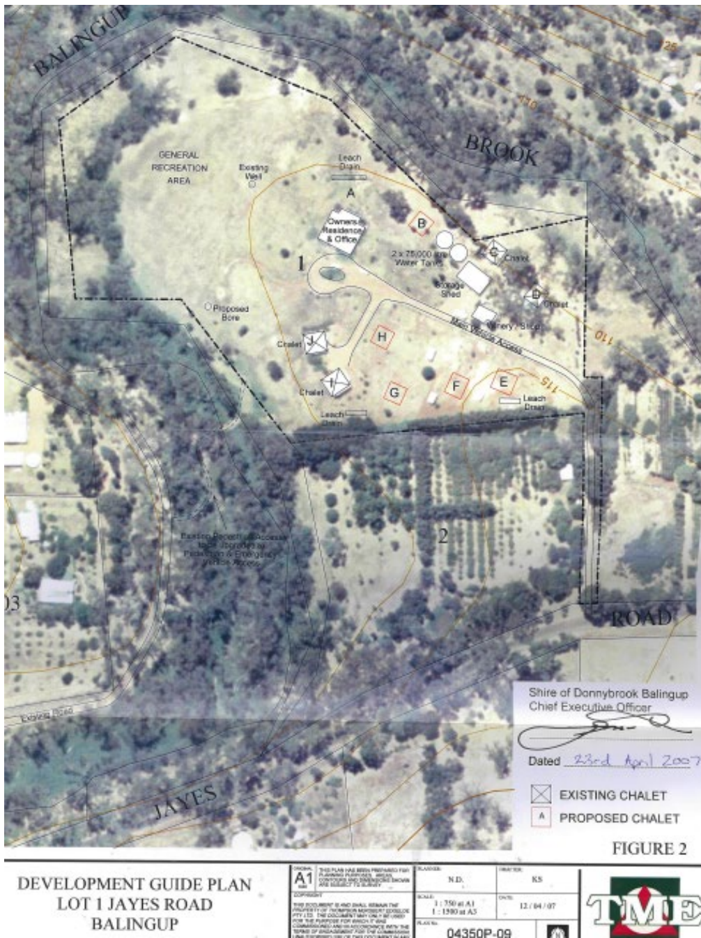
Figure 2 – Development Guide Plan 04350P-09