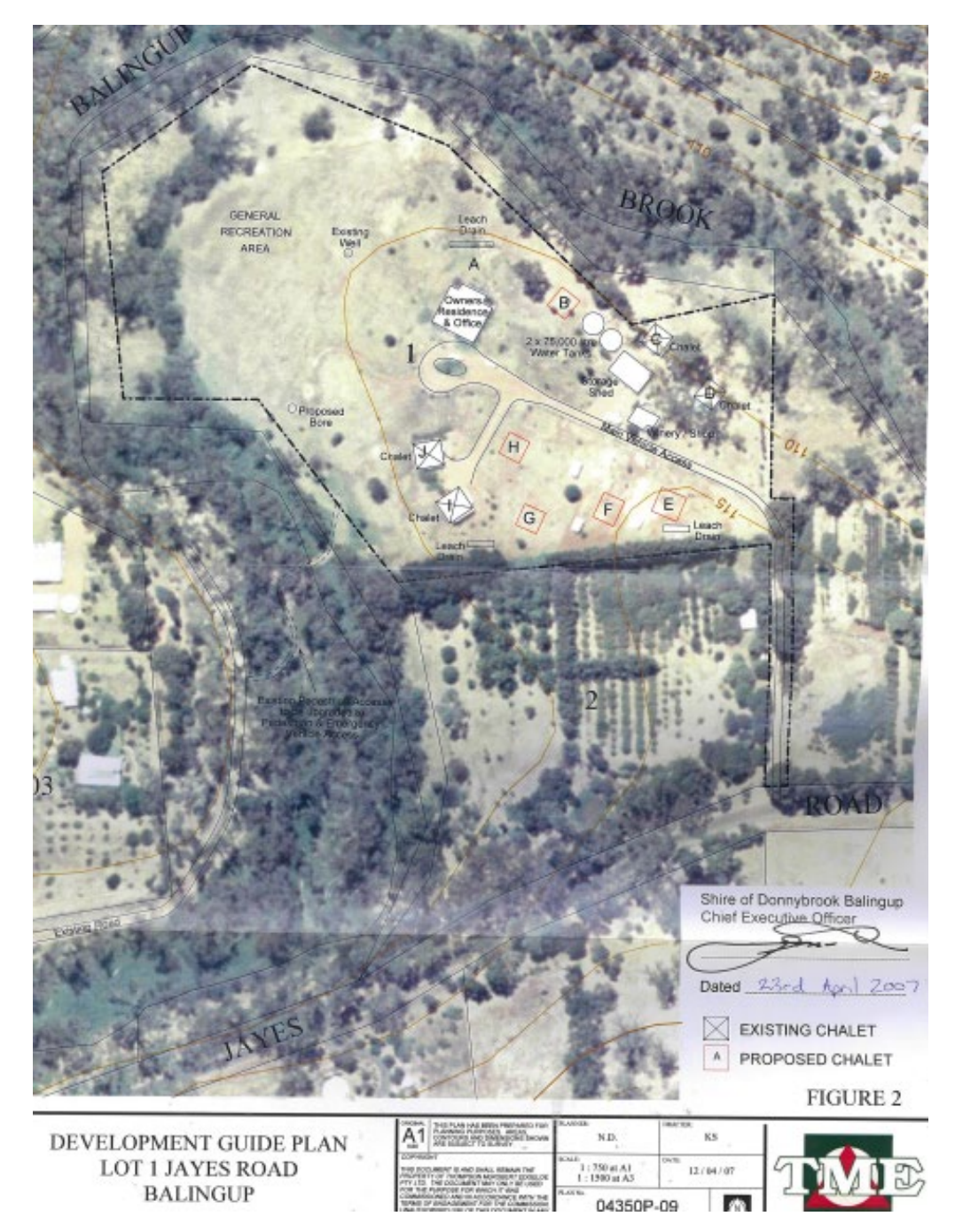
Figure 2 – Development Guide Plan 04350P-09