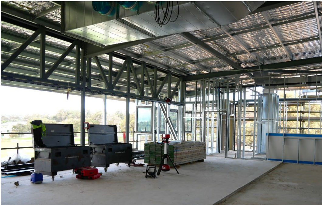
Top floor of Pavilion 1, with roofing complete and inside infrastructure underway. The enclosed room at the end of this area will become a rentable office-like space for scoring, commentators, and other office or meeting purposes.