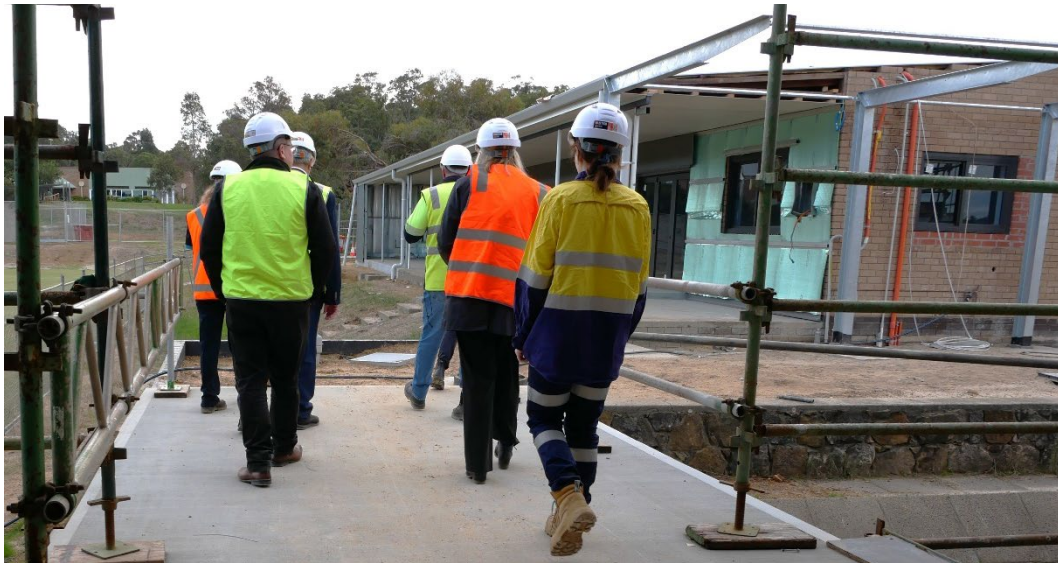
The bridge between Pavilion 1 and Pavilion 2, connecting the two spaces.