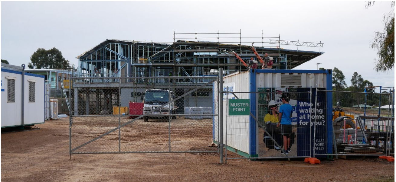
Entry to the construction site, showing Pavilion 1 (two storeys, roof sheeting in place).

Shire of Donnybrook Balingup 28 June 2024