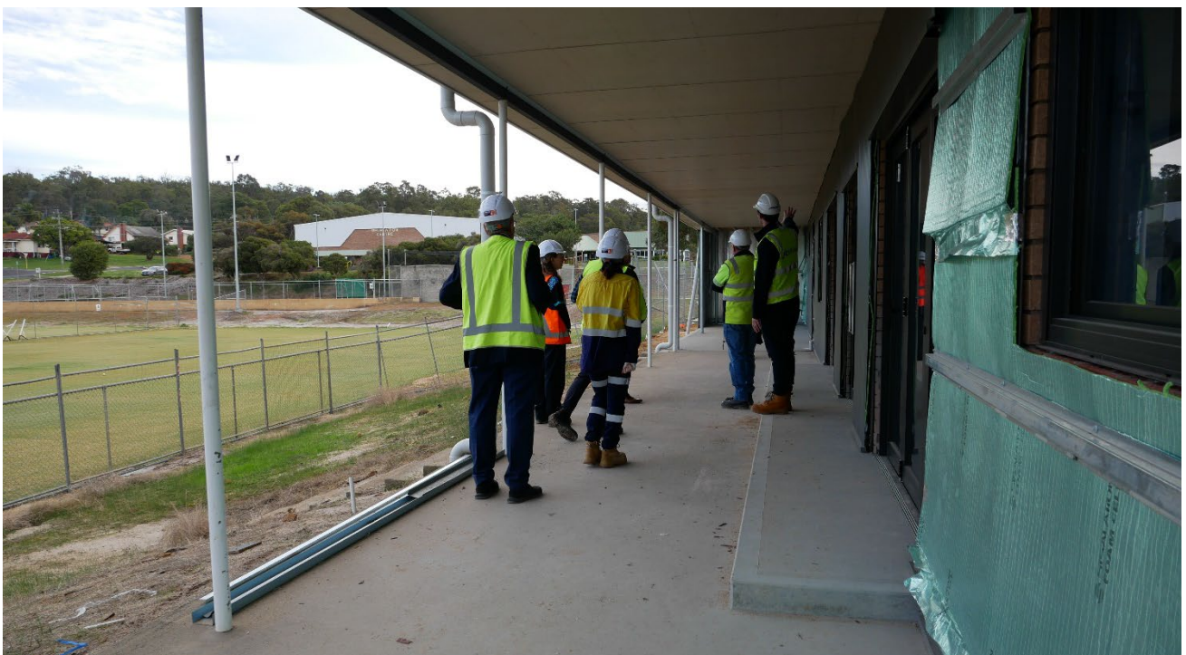
Newly extended alfresco area at Pavilion 2.