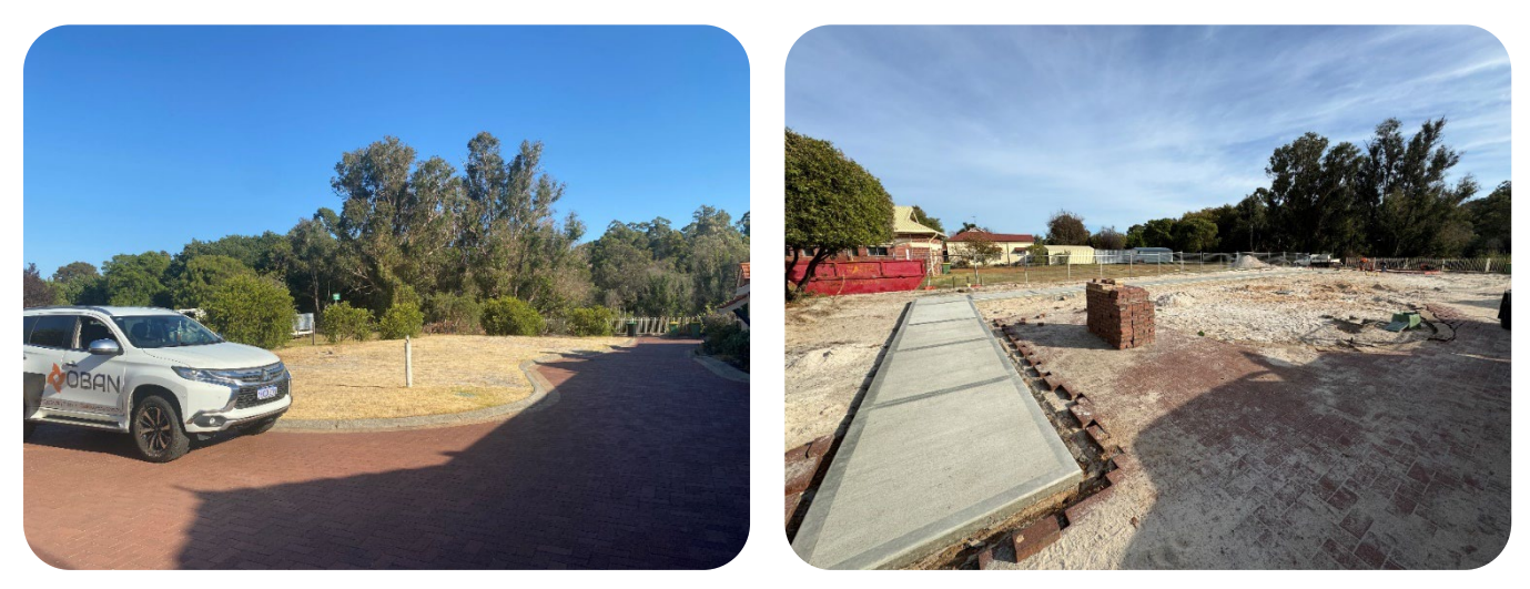
New parking and foortpaths to lead to the gazebo area (before on the left, current on the right).